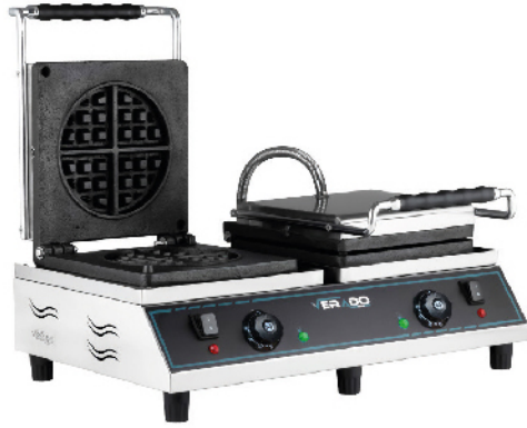
Plate Material : Cast Iron