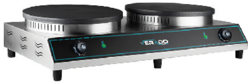
Plate Material : Cast Iron