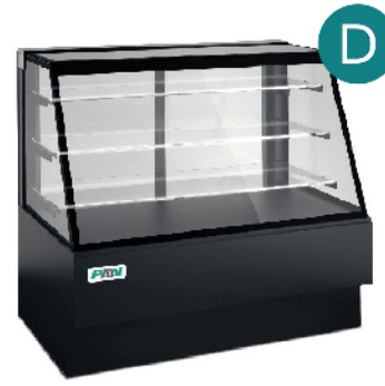
Diagonal Pastry Display Refrigerator