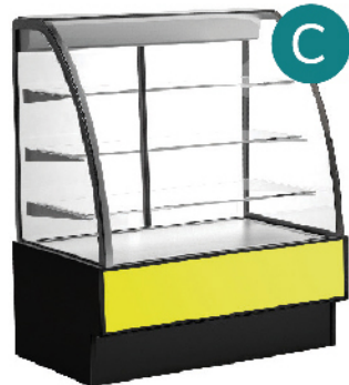
Curved Pastry Display Refrigerator