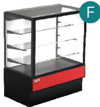
Flat Pastry Display Refrigerator